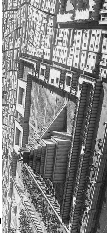
Table: Vessels in a great house (2 Timothy 2 & Daniel 1)